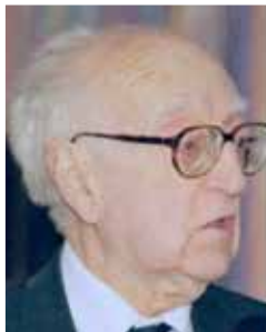
Sir Douglas Black