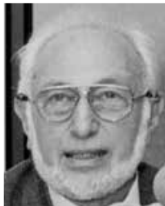
Professor Ivan Roitt