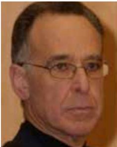
Prof John SYudkin