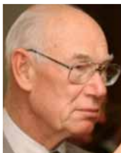
Mr Ken Tyrrell