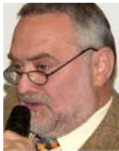
Prof Sir Salvador Moncada