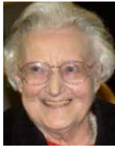
Dame Cicely Saunders