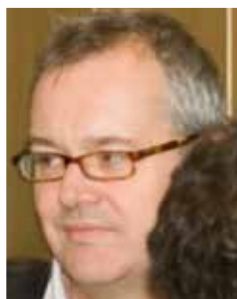
Prof Sir Patrick Vallance