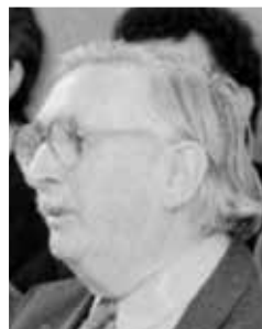
Sir Godfrey Hounsfield