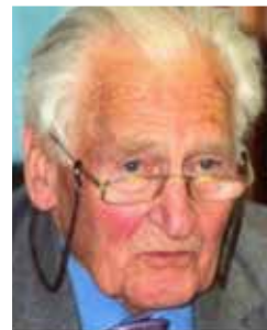
Prof Sir Richard Doll