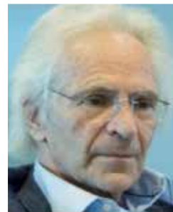
Prof Sir Marc Feldmann