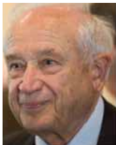
Prof Raphael Mechoulam