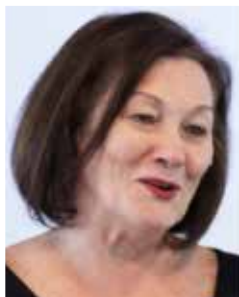
Dame Joan Ruddock