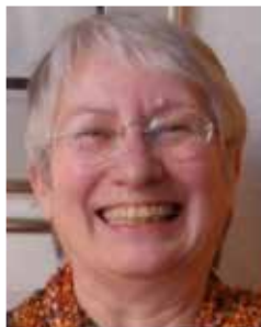
Prof Uta Frith