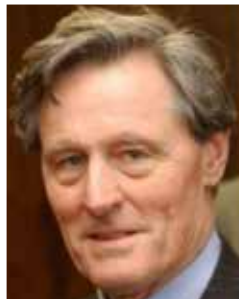
The Duke of Montrose