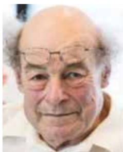
Prof Heinz Wolff