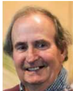
Prof (Sir) Peter Harper