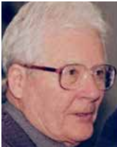
Prof James Lovelock