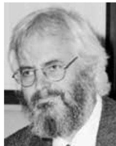
Dr Georges Köhler