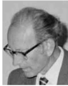
Prof César Milstein