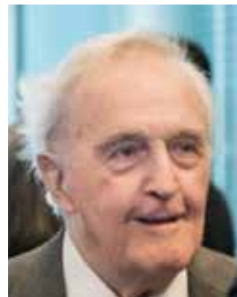
Prof Sir David Weatherall