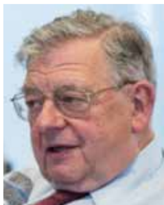
Prof Sir Walter Bodmer