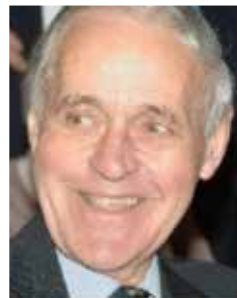
Sir Rodney Sweetnam