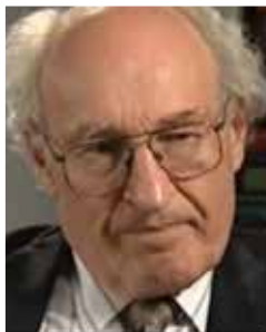
Prof Sir Michael Rutter