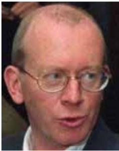
Dr Shaun Murphy