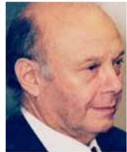
Lord (Leslie) Turnberg