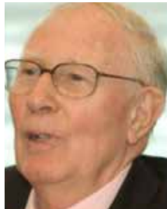
Prof Sir Roger Bannister