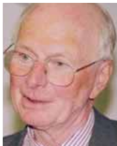
Prof John Lennard-Jones