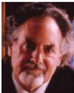
Prof Geoffrey Burnstock