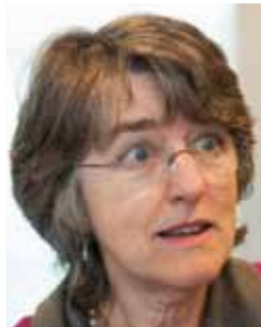
Baroness Ilora Finlay