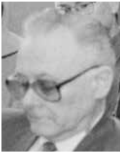
Prof Sir Peter Mansfield