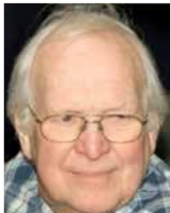
Prof Sir James Black