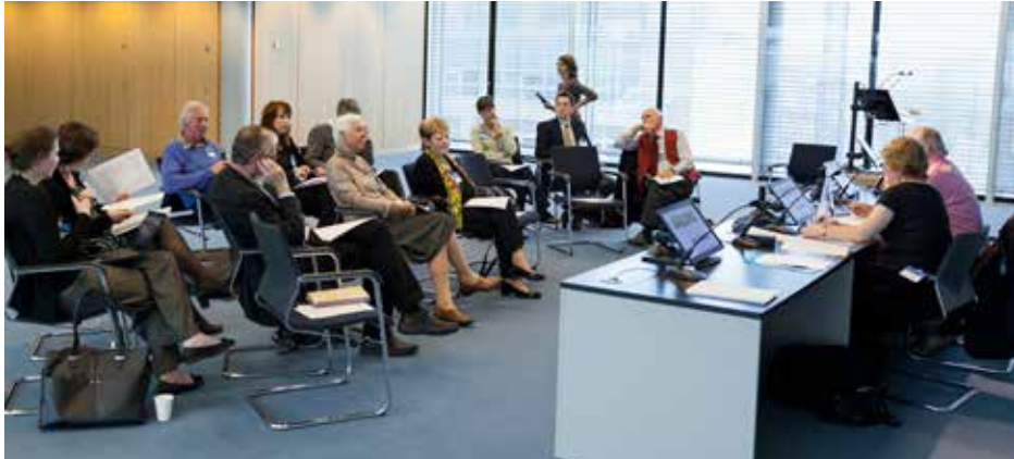
Figure 3: Participants at the Witness Seminar