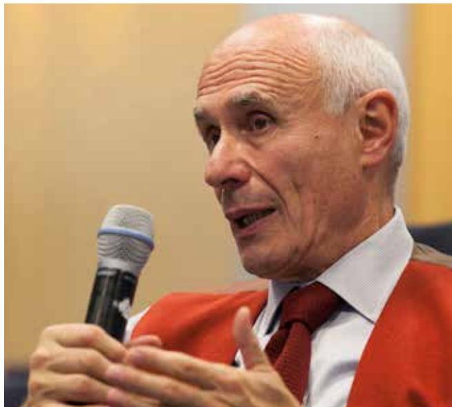
Figure 4: Professor Peter Lantos

Lantos: I would like to make a point at the beginning, which may be pertinent to later discussion, that there is a difference between collecting brains and brain banking. Collecting brains for diagnostic purposes goes back a very long time, you can argue to the beginning of medical research. If one has brains for one's own interest, preserving material for one's own research, and research with immediate collaborators, that is collecting brains. On the other hand, brain banking is something completely different: preserving tissues with specific aims and distributing tissues to the scientific community without necessarily the locals being involved, but they usually are. So I'm not sure whether the Corsellis collection started as a brain bank or whether Nick Corsellis, who was interested in certain neurodegenerative processes, including dementia, had a fantastic collection of brains, which he was generous enough to distribute to other people as well. 15 But, for instance at the Middlesex Hospital, which exists no more, we had a brain collection but it was not a brain bank. We kept brains that were of some interest to us and our immediate collaborators. So brain banking is somewhat different.