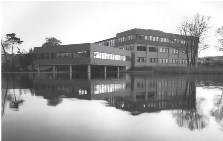
Figure 1: AstraZeneca Clinical Trials Unit, South Manchester